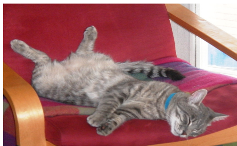
Not the author, but possibly his cat!

Ultimately, the beauty and simplicity of this mathematical formulation itself strongly suggests the correctness of the physics. And it also points the way